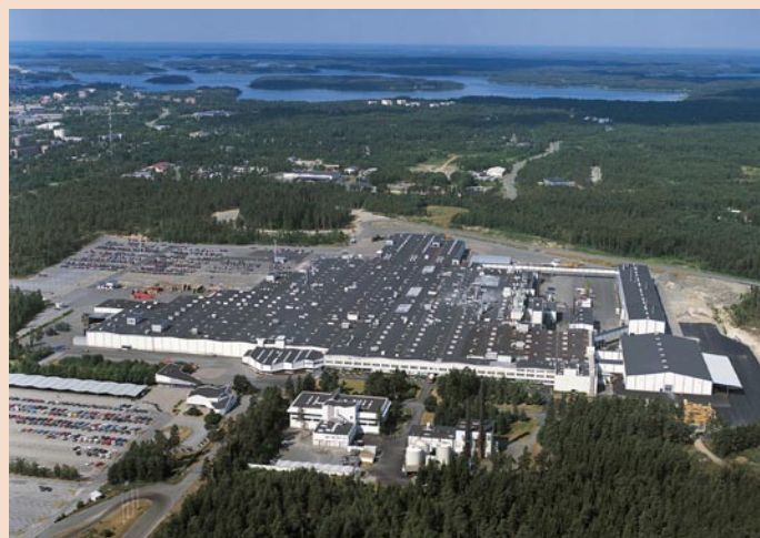
Picture 2. Valmet Automotive, Uusikaupunki plant

Wonderware MES solution for Valmet Automotive production was completed in three months in summer 2009. The fast project development and implementation of the MES solution assisted Valmet Automotive in its efforts to adjust production processes to the changed markets and customer needs.