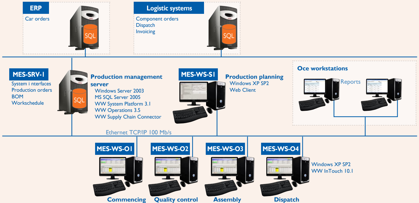
Picture 3 Valmet Automotive (Uusikaupunki). MES solution configuration